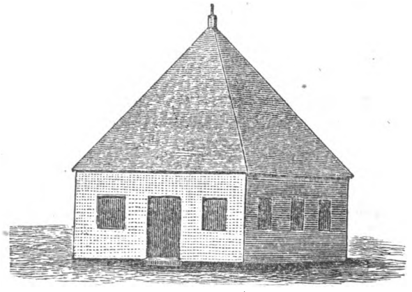
First Meeting House in Connecticut.

The above is believed to be a correct representation of the first house ever erected in Connecticut for Christian worship, built in 1635. Some of the lumber of the first house is still in existence, a portion of it being used in the construction of the Centre Congregational Church.